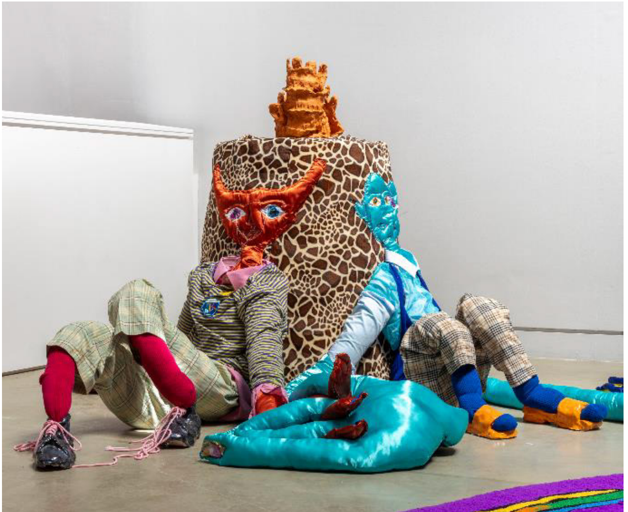
friendly gathering of beings

Classroom activity in response to Afra Eisma's 'friendly gathering of beings' in the gallery atrium. Using socks as an accessible starting point, this is a textile-based activity that can be developed and adapted appropriately for each Key Stage. Beings can be used to prompt conversations about how we can process and symbolise emotions, e.g. focus on Afra's thoughts on anger being a positive emotion that is a force for change.