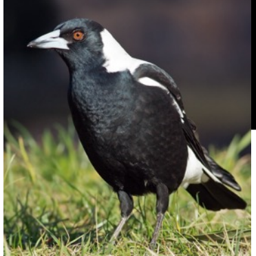
Magpie

Every English schoolchild knows that counting Magpies will tell your fortune. One for sorrow, two for joy, three for a girl Four for a boy Five for silver, six for gold, Seven for a secret never to be told.