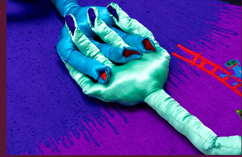
Suitable for EYFS - KS2