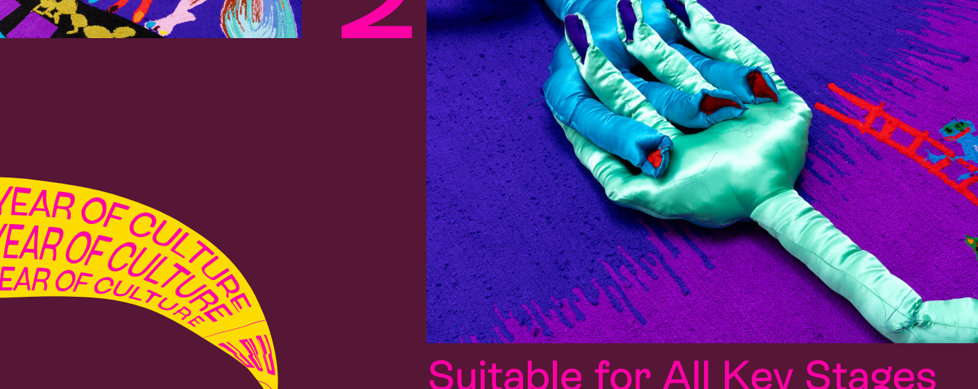
Suitable for All Key Stages