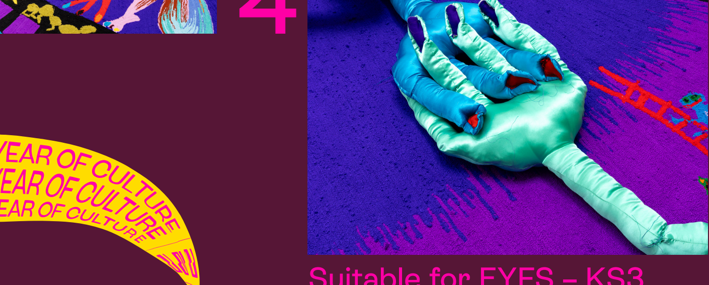
Suitable for EYFS - KS3